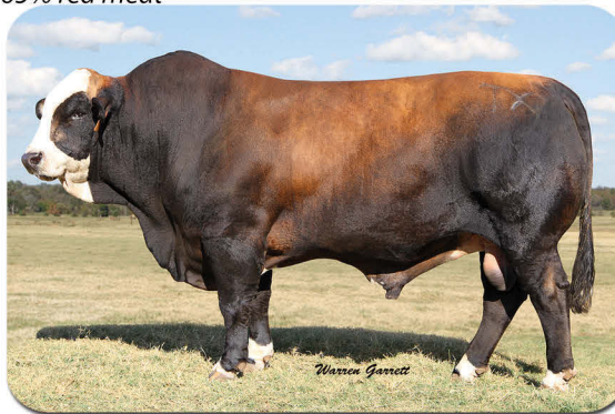
PRR RITO 545W ASA # 2513491 Sired by PRR Perfection 82S and out of PRR Clarita 522P

At Pine Ridge Ranch, it's about the consumer!